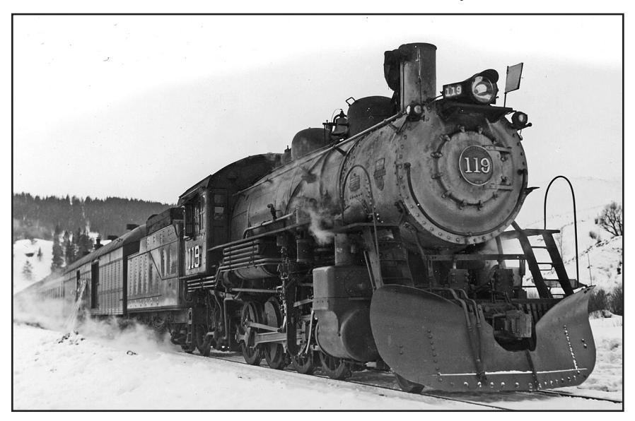
Steam Locomotive Photo Gallery

D&SL engine #119 is on the head end of a winter special at Hot Sulphur Springs, Colorado, on February 26, 1939. You may be able to distinguish skis propped up on the side of the baggage car. These wintertime excursions were run to Hot Sulphur Springs for a number of years. This train has been turned on the wye and is ready for its return to Denver.