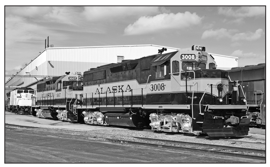
Alaska Railroad 3008 and 3007 have been freshly painted and are ready for shipment back to Alaska.