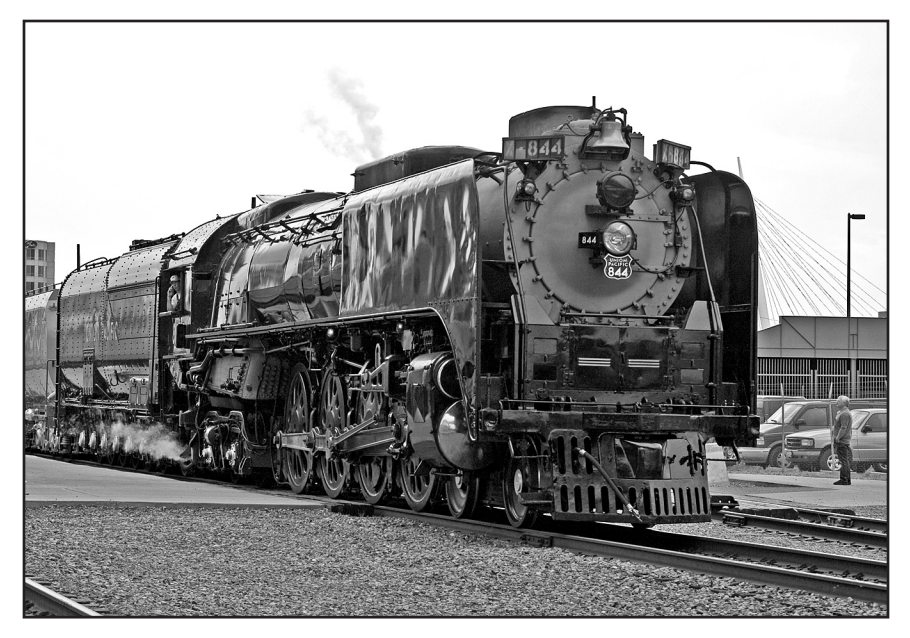
UP Steam Locomotive #844 is positioned in the Denver yards after a July 2006, trip from Cheyenne. The train is being prepared for the Denver Post Cheyenne Frontier Days Train.